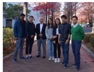
<Graduates in 2021>

The university administration strongly supports his/her application for the job.